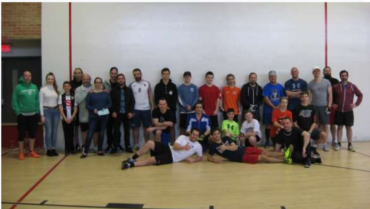
Classique Saint-Jean-Eudes (April 2017)