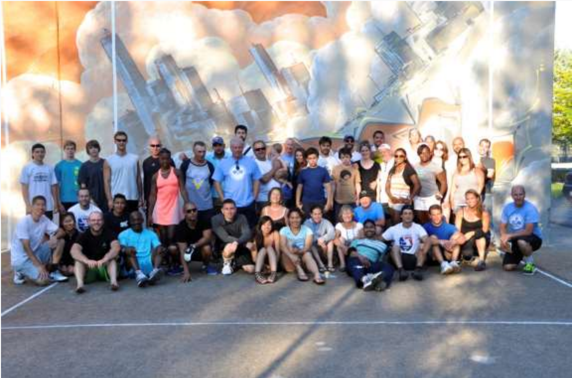
Honey Martin's, Montréal (2014)