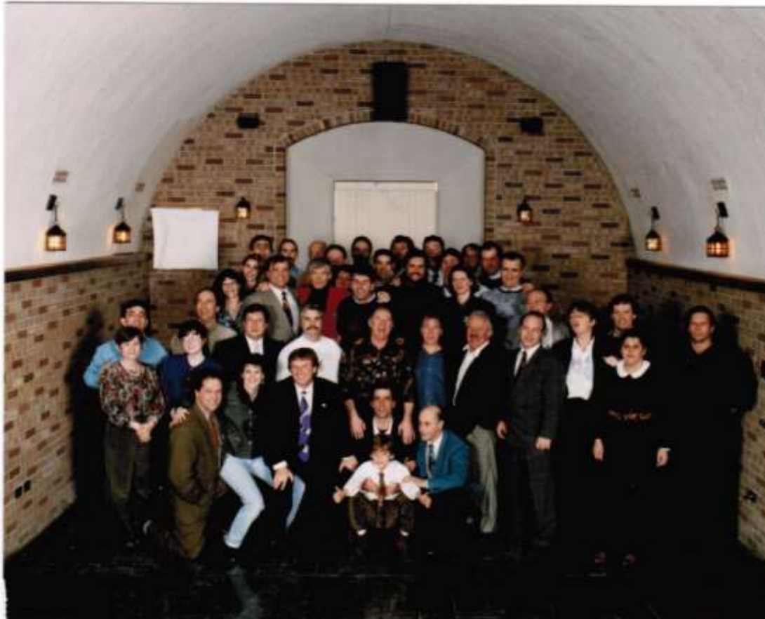
Players from Quebec City in the 80s.